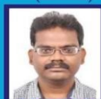
Key Note Speaker